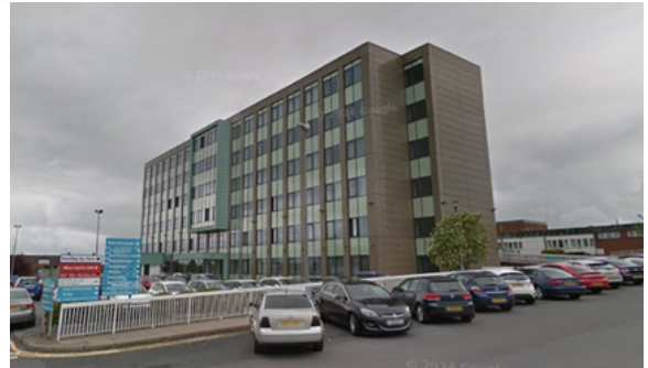
Main hospital building

STH Gordon Thompson Suite Parking: Outside Main Building