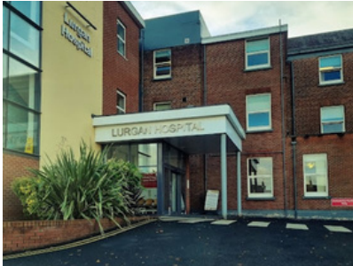
Main hospital entrance