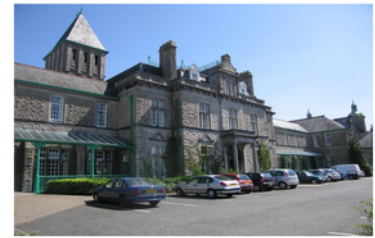
Hill Building, St. Luke's Hospital