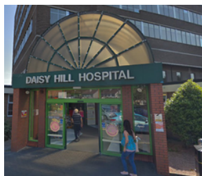
Main hospital entrance