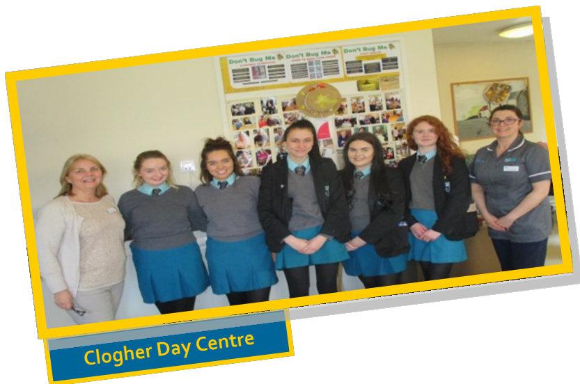
Clogher Day Centre