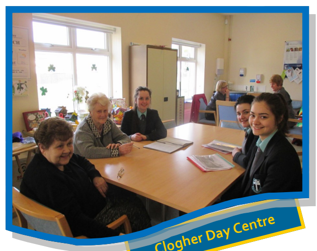
Clogher Day Centre