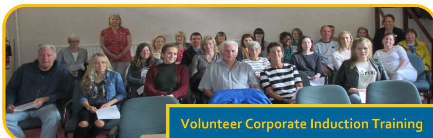
Volunteer Corporate Induction Training

prevention & control and corporate governance. This training demonstrates our continued commitment to provide a high quality safe and effective service to all our service users. It ensures everyone who volunteers within our organisation has a high level of knowledge about their role and what support they can expect from key workers and volunteer co-ordinators.