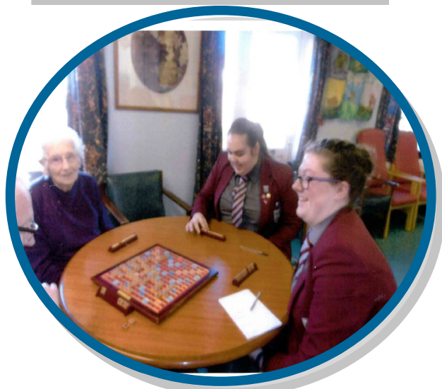
Donard Day Centre