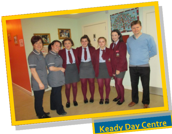
Keady Day Centre

Enable volunteering to develop while not replacing the role of paid staff continued