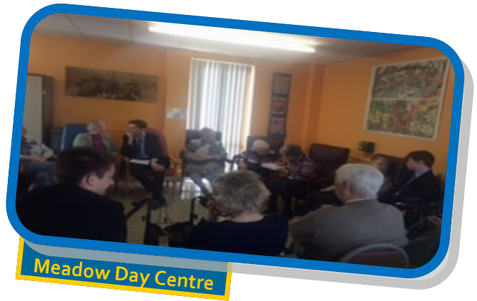
Meadow Day Centre