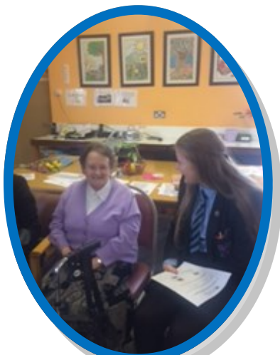
Meadows Day Centre

Comment from schools included - "It was a wonderful experience for the girls and they thoroughly enjoyed it. It's a good chance for the students to gain experience on what happens within Day Centres."