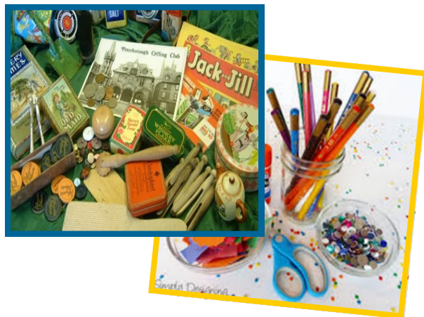
Lisanally Day Centre