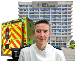
Hospitals and Ambulances

Examples of health and social care services are