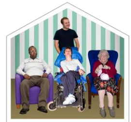
Care Homes and Day Centres