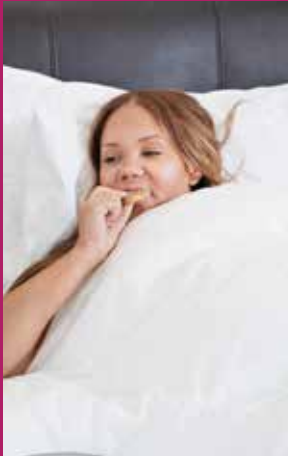
Person is drowsy, sick, upset or agitated