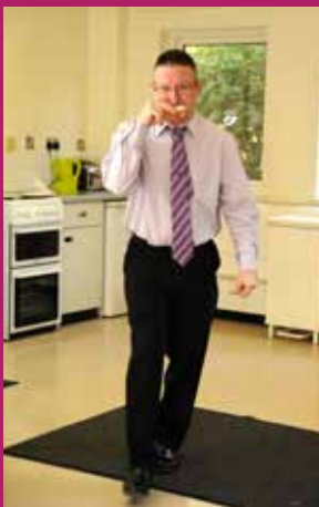
Moving around when eating