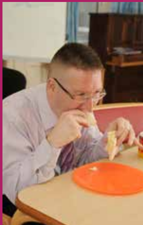
Eats too fast