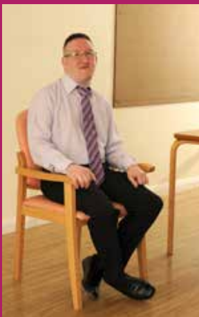
Person is unable to maintain a stable and upright position while eating