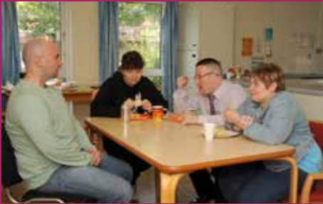
Person is easily distracted