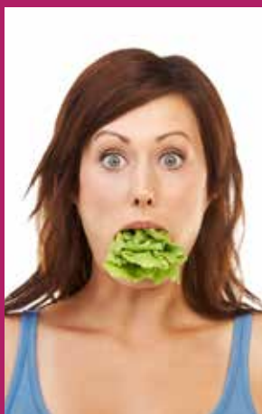
Overfills the mouth