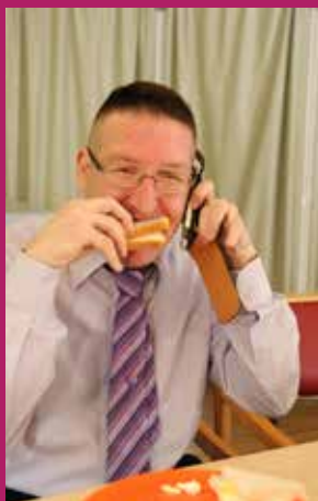
Likes to talk when eating