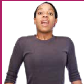
Person has difficulty coordinating breathing with swallowing