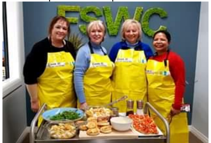
A pre COVID Cook it! in action at First Steps Women's Centre, Dungannon