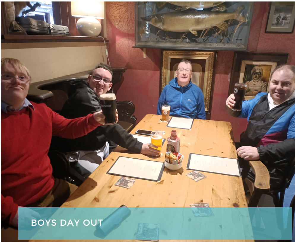
BOYS DAY OUT

Hello and welcome to our very first newsletter, keeping you up to date with all the adventures and goings on in Lilburn Hall supported living. We hope you enjoy following us along on our daily lives.